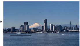
↑ view from skywalk

Every Saturday, I go to the Iaido dojo in Kawasaki. When the weather is nice, I stop by Skywalk on my way home.