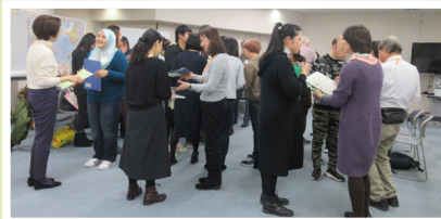
In groups, we exchanged our names, talked about the food we like and travel in Japan... We get to know each other while using Japanese.