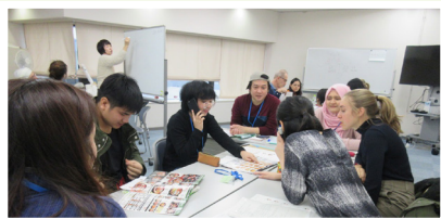
The topic was restaurants. We practiced how to use Japanese when in a restaurant, from entering the restaurant to paying the bill. At the end, we practiced how to order pizza!

For those who live in Yokohama, this is a place where you can learn useful everyday Japanese. Let's enjoy learning Japanese with a group or one-to-one..., any style you want!