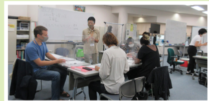
We take measures against coronavirus infection! We discussed what we have been doing during the stay-at-home period. Everybody looked happy with a smile!